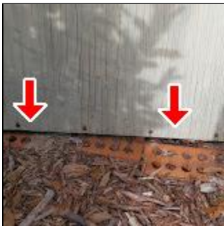
5.0 Item 1(Picture) Crawlspace access door

5.0 There are loose bricks at base of crawlspace door that could allow varmints to enter crawlspace. Recommend further evaluation and repairs.