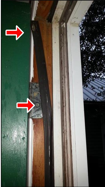
2.1 Item 1(Picture) Rear french door

2.1 Weather stripping at front entry and rear french doors are frayed and coming loose. Recommend further evaluation and repairs.