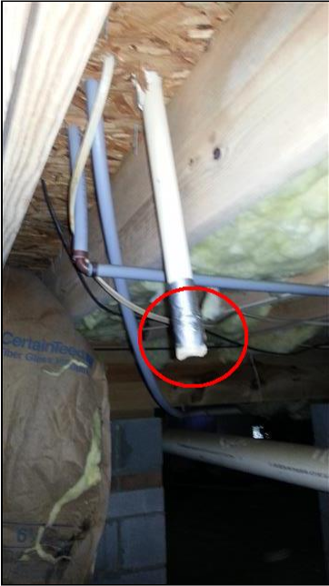
6.2 Item 1(Picture) Hot water heater pan drain

6.2 The hot water heater pan drain line has tape over end of pipe so drain pan can't drain properly if needed. Drain line should also drain to outside of house and not in crawlspace. Recommend further evaluation and repairs by a qualified professional.