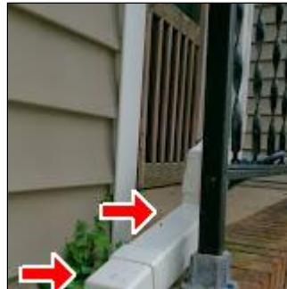
1.3 Item 3(Picture) Downspout at front porch