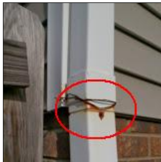
1.3 Item 6(Picture) Right rear corner downspout