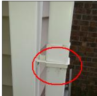
1.3 Item 2(Picture) Front left downspout