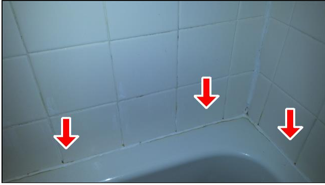
4.1 Item 1(Picture) Master bath

4.1 The tile around tub in master bath and upstairs bath are in need of caulk or grout at base of wall at tub. Recommend further evaluation and repairs