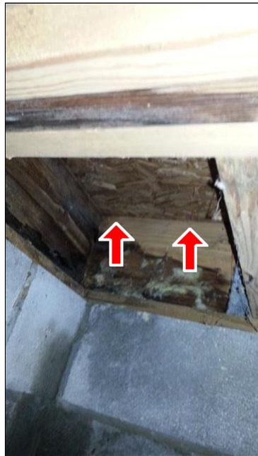
9.1 Item 2(Picture) Sub floor