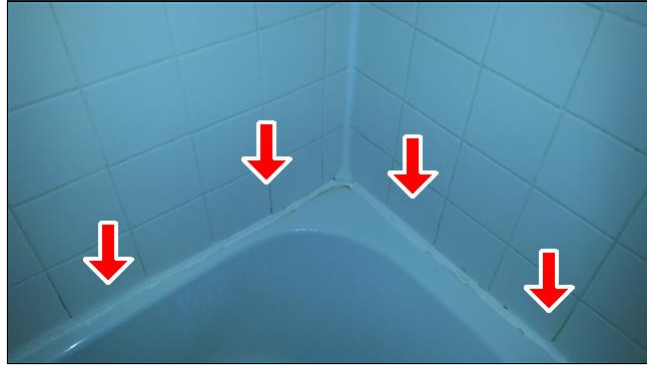
4.1 Item 2(Picture) Upstairs bath

4.2 The floor in front of washer/dryer has water stains. This could be from leakage or overflow from washer. A pan under washer could reduce possibility of damage to hardwood floors.