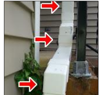
1.3 Item 4(Picture) Downspout at front porch