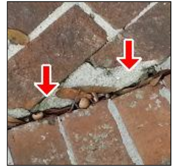
2.3 Item 4(Picture) Patio stairs

2.4 There appears to be two drains in driveway in front of garage and downspouts divert water away from house through drainage pipes at front of house. There was a heavy rain and drainage appears to be adequate as there were no signs of water in crawlspace.