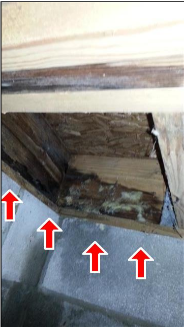
5.3 Item 1(Picture) Floor and band

5.3 There were signs of water stain and penetration at sub floor and outside band below entry door. There was flashing and caulk around top edge of front porch concrete slab. There was no signs of active water penetration at this area but would recommend monitoring this area for future water penetration.