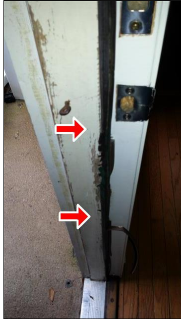
2.1 Item 2(Picture) Front entry

2.3 The metal railings at front porch are loose and could be a potential safety issue as they don't allow for proper support. The bottom step at rear deck stairs is uneven and could be a potential trip hazard. The brick border at patio is separated from patio and could be a potential trip hazard. Recommend further evaluation and repairs by a qualified professional.