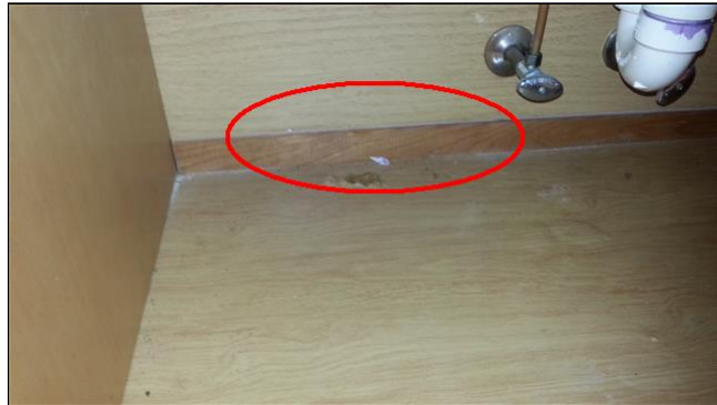
6.0 Item 2(Picture) Cabinet base

6.1 (1) The 1/2 bath faucet, right master bath sink faucet, tub faucet and both upstairs sink faucets have bad seals and leak at handles. Recommend further evaluation and repairs by a qualified professional. There were supply lines identified in crawlspace that are polybutylene. Polybutylene plastic plumbing supply lines (PB) are installed in the subject house. Polybutylene has been used in this area for many years, but has had a higher than normal failure rate, and is no longer being widely used. Copper and Brass fittings used in later years have apparently reduced the failure rate. This subject house has Copper and Brass fittings. For further details contact the Consumer Plumbing Recovery center at 1-800-392-7591 or the web at http://www.pbpipe.com