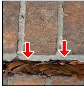
2.3 Item 3(Picture) Patio stairs