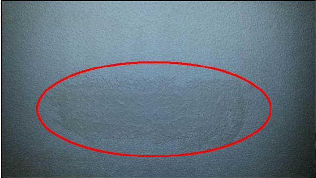
4.0 Item 1(Picture) Left upstairs bedroom

4.0 There is repair of sheetrock at ceiling in left upstairs bedroom. There are no signs of active leakage. Area was below ridge vent and could have been caused by heavy wind and rain. Recommend monitoring this area for future leakage.