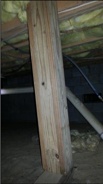
5.2 Item 1(Picture) Post in crawlspace

5.2 There was post added in crawlspace under post at bottom of stair railing as you enter house. There are know signs of any sag or settlement but would recommend monitoring this area for any possible future settling.