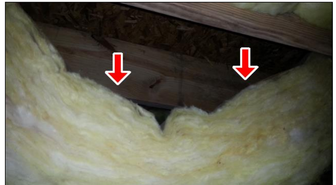
9.1 Item 3(Picture) Loose insulation