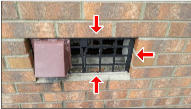
9.3 Item 1(Picture) Foundation vent

9.3 There are five foundation vents that are missing screen or have holes in vent screen (1 at rear, 3 on right side and 1 in garage). There are no vent covers to close vents in winter months at foundation vents. Recommend further evaluation and repairs.