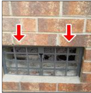
9.3 Item 2(Picture) Foundation vent

The insulation and ventilation of the home was inspected and reported on with the above information. While the inspector makes every effort to find all areas of concern, some areas can go unnoticed. Venting of exhaust fans or clothes dryer cannot be fully inspected and bends or obstructions can occur without being accessible or visible (behind wall and ceiling coverings). Only insulation that is visible was inspected. Please be aware that the inspector has your best interest in mind. Any repair items mentioned in this report should be considered before purchase. It is recommended that qualified contractors be used in your further inspection or repair issues as it relates to the comments in this inspection report.