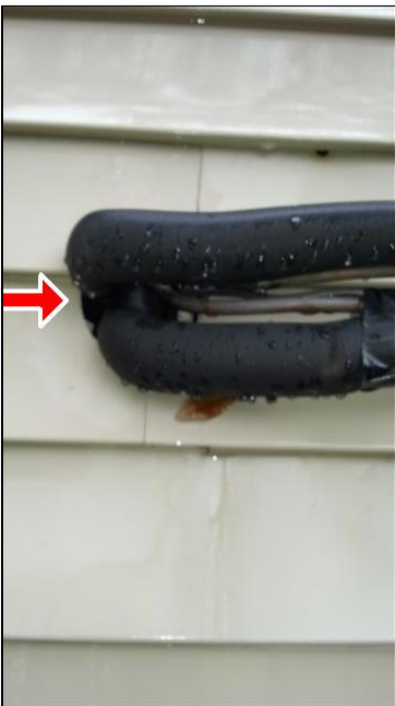
2.0 Item 1(Picture) Side of garage

2.0 There is opening around refrigerant line from heat pump as it enters side of house at garage that could allow varmints to enter house. Recommend further evaluation and repairs by a qualified professional.