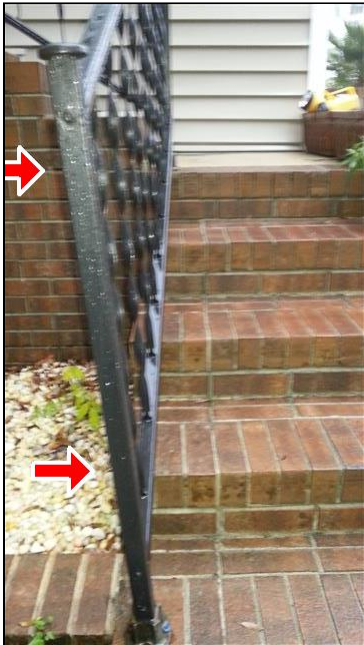
2.3 Item 1(Picture) Front porch railing

2.3 The metal railings at front porch are loose and could be a potential safety issue as they don't allow for proper support. The bottom step at rear deck stairs is uneven and could be a potential trip hazard. The brick border at patio is separated from patio and could be a potential trip hazard. Recommend further evaluation and repairs by a qualified professional.