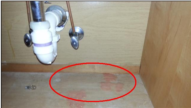
6.0 Item 1(Picture) Cabinet base

6.0 Main water shutoff is under house as water line enters crawlspace at front porch. The only water shutoff that could be located outside of house was at water meter at street. Most of the sink cabinets in bathrooms and kitchen had water stains from past leaks. There were no signs of active leaks other than bad seals in faucets but would recommend monitoring. The toilet in half bath was loose at base and needs to be secured with a new seal. Recommend further evaluation and repairs by a qualified professional.