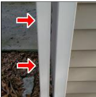
1.3 Item 5(Picture) Downspout at right of garage