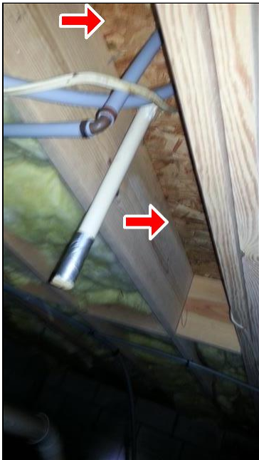
9.1 Item 1(Picture) Sub floor

9.1 There are several areas in crawlspace at sub floor that has missing or loose insulation. Recommend further evaluation and repair.