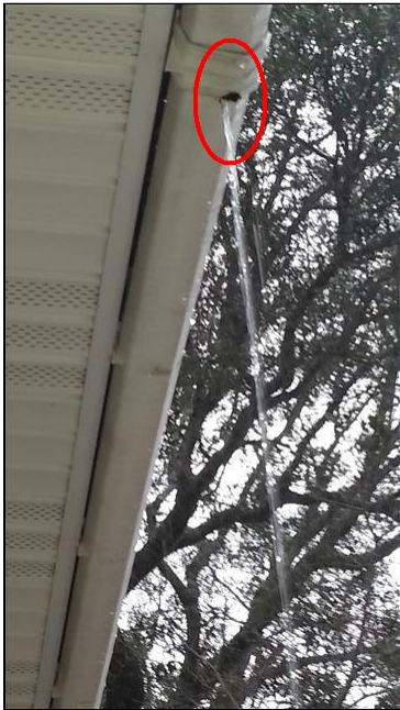
1.3 Item 1(Picture) Gutter over garage door

1.3 There is a hole in bottom of gutter over garage door at front of house that was leaking at time of inspection. All of the downspouts around house are loose and not properly attached to house or have broken clips. There is only one downspout at gutter at top of rear of house. This is not adequate to handle the amount of rain water there was at time of inspection and gutter overflowed to lower roof over kitchen. This could possibly allow water penetration around the windows at master bedroom or at kitchen roof where it attaches to house. Recommend further evaluation and repairs by a qualified professional.