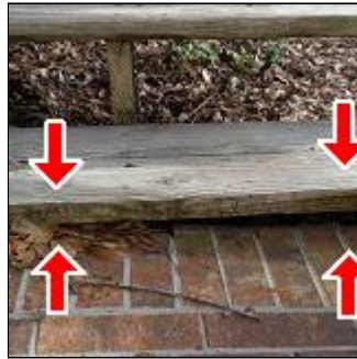
2.3 Item 2(Picture) Deck stairs