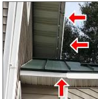
1.3 Item 7(Picture) Roof over kitchen