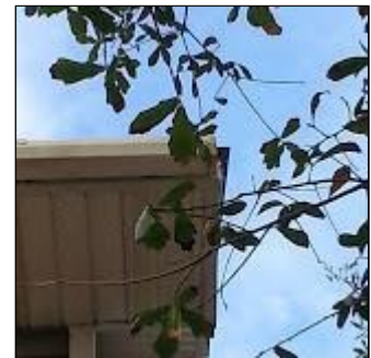
1.3 Item 8(Picture) Left rear gutter

The roof of the home was inspected and reported on with the above information. While the inspector makes every effort to find all areas of concern, some areas can go unnoticed. Roof coverings and skylights can appear to be leak proof during inspection and weather conditions. Our inspection makes an attempt to find a leak but sometimes cannot. Please be aware that the inspector has your best interest in mind. Any repair items mentioned in this report should be considered before purchase. It is recommended that qualified contractors be used in your further inspection or repair issues as it relates to the comments in this inspection report.