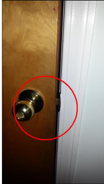
4.5 Item 2(Picture) Upstairs right bedroom

4.6 The window sliders in upstairs bedrooms are difficult to open and the one in the left bedroom doesn't always open not allowing for proper egress. This could be a potential safety issue and recommend further evaluation and repairs by a qualified professional.