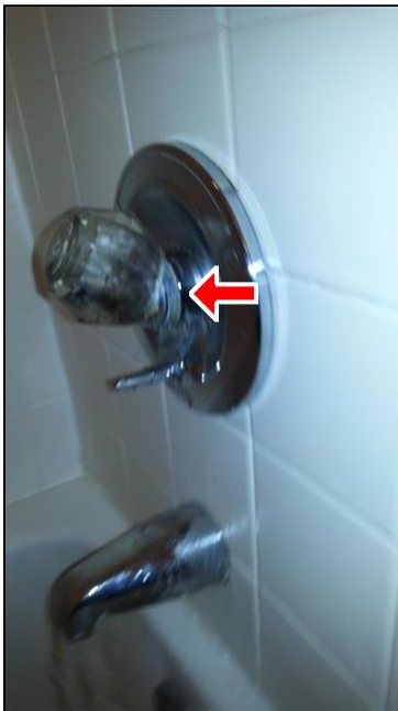
6.1 Item 1(Picture) Faucet handle

6.1 (1) The 1/2 bath faucet, right master bath sink faucet, tub faucet and both upstairs sink faucets have bad seals and leak at handles. Recommend further evaluation and repairs by a qualified professional. There were supply lines identified in crawlspace that are polybutylene. Polybutylene plastic plumbing supply lines (PB) are installed in the subject house. Polybutylene has been used in this area for many years, but has had a higher than normal failure rate, and is no longer being widely used. Copper and Brass fittings used in later years have apparently reduced the failure rate. This subject house has Copper and Brass fittings. For further details contact the Consumer Plumbing Recovery center at 1-800-392-7591 or the web at http://www.pbpipe.com