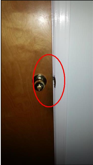
4.5 Item 1(Picture) Master bedroom

4.5 The master bedroom and upstairs right bedroom doors have gap at latch side of door and don't latch or lock properly. Recommend further evaluation and repairs.